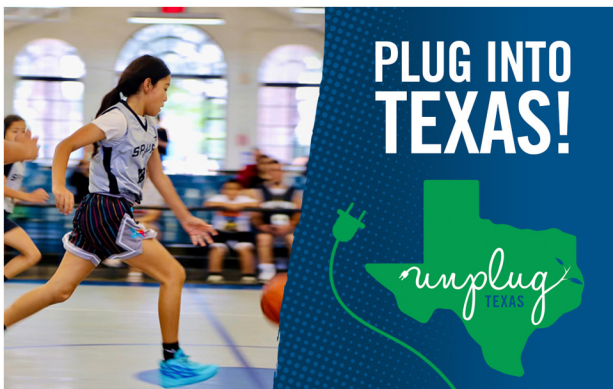
1080 X 680 px