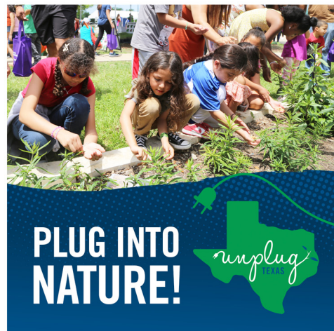
1080 X 1080 px