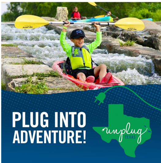
1200 X 1200 px

There are various social media graphic assets available for use and can be customized for your agency.