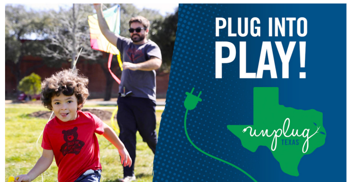
1200 X 630 px